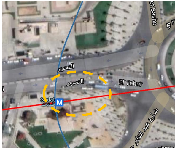
Connection between Line 2 and 1

Share two stations with Line 1 and one with Line 3 for easier transfer