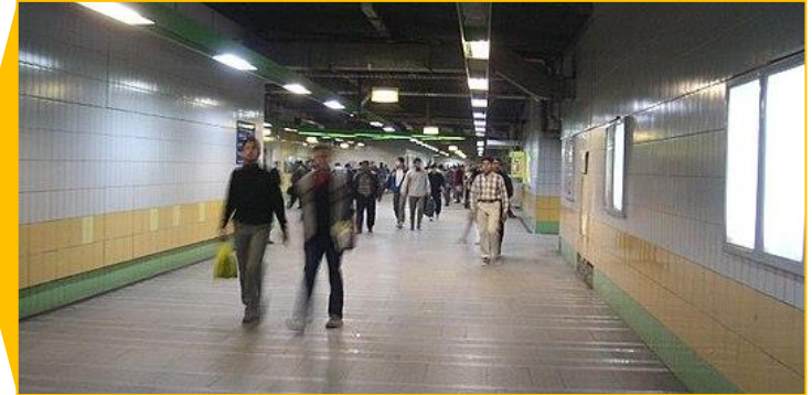
Concourse of Attaba Sta.