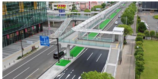
Pedestrian deck (Takasaki Sta.)