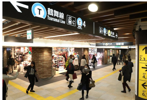
Stores in Nagoya City Subway Sta.