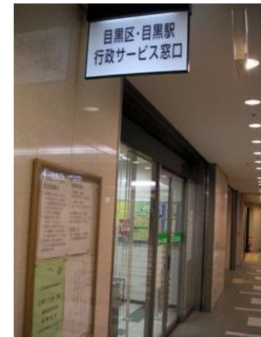
Public Service Counter in Meguro Sta.