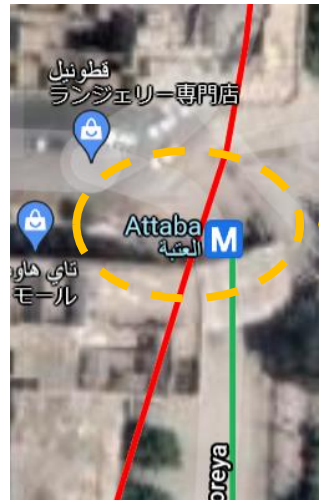
Line 2 and 3