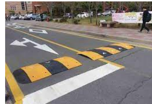
Steps for vehicle speed control (Korea)